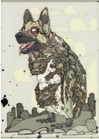
Upright Shepherd Walker , 2006 Ink and acrylic on mylar 15" x 11"