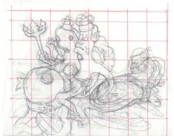
Untitled (Study for "The Neptunes") , 2005 Pencil and colored pencil on paper 10.25" x 13"