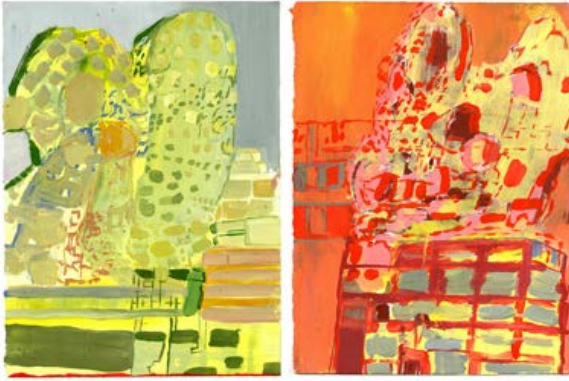
Lucifer , 2009 Acrylic on paper 14" x 12"