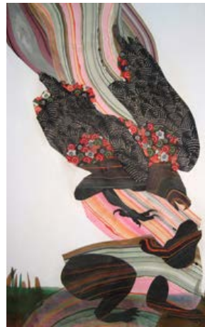
Common Buzzard , 2009 Mixed media on paper 20" x 13"