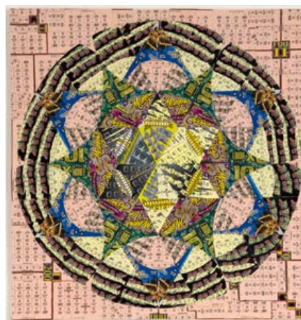
Image from Earth's Iron Core , 2008 $920 in used lottery tickets 24" x 28"