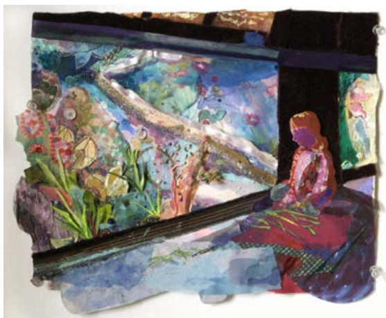
The Builder is Also the Dreamer (Annie at the Aquarium) , 2009 Collage 10" x 13" Courtesy of Carol Barrett