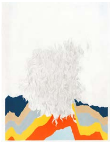
Grandfather Mountain , 2009 Gouache and graphite on paper 20" x 16"