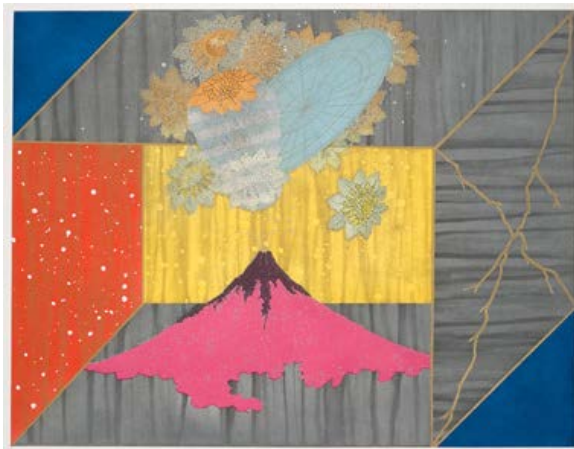
Mt. Fuji , 2006 Color etching, aquatint, spitbite 25.75" x 29.875"