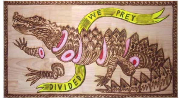
Divided We Prey , 2009 Wood burning 20" x 36" Courtesy of the artist