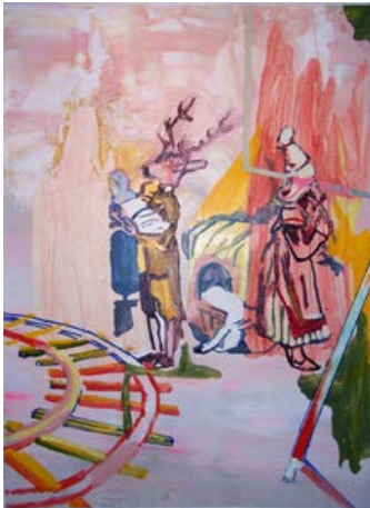
Train Stop , 2009 Acrylic and pen on paper 32" x 24"