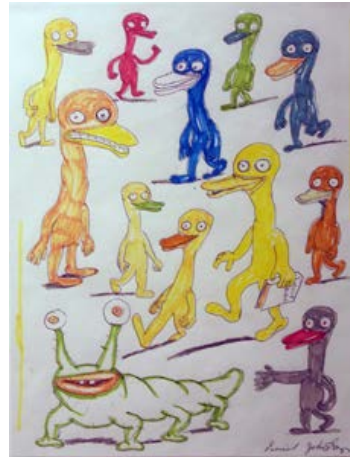
Untitled , 1998 Pen and marker on paper 11" x 8.5" Private collection, New York