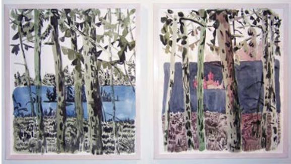
Untitled , 2010 Watercolor 21.25" x 24.5"