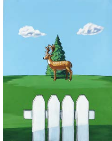
Untitled (The Doe) , 2005 Acrylic on paper 40" x 31"