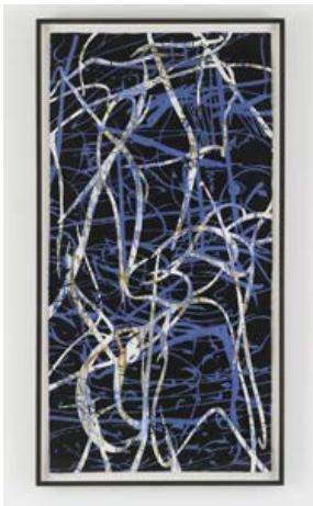
Mine , 2007 Pigmented abaca watermark on pigmented cotton base sheet with hand-cut collaged pulp painting 60" x 30"