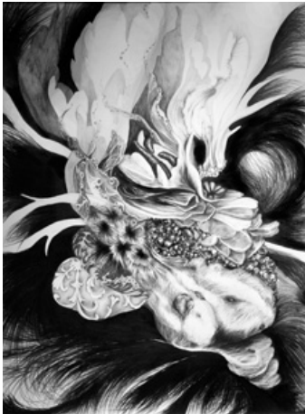
Crowning , 2009 Graphite on archival paper 50" x 38" Courtesy of the artist