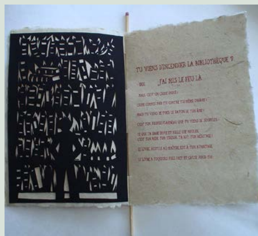
A Qui La Faute , 2004 Text by Victor Hugo(1802-1885)- A qui la faute? (who's fault?) from L'année terrible. Cut paper, edition of 3 8 1/2 x 6 inches Courtesy of the artist