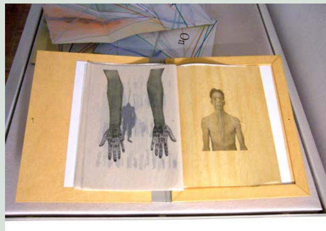
The Thrill Came Slowly , 1996 Bound codex book in portfolio Photo polymer and letter press on translucent Japanese paper with thread and wire 12 1/8 x 9 1/4 inches Edition of 25 Published by Pyramid Atlantic; produced by Peter Kruty Editions NY; supported by The Mid-Atlantic Foundation