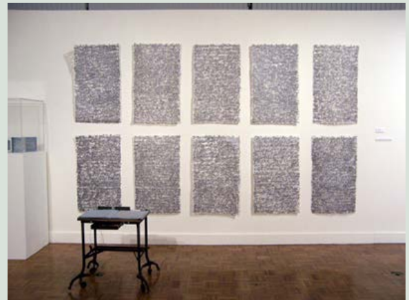
G-O-D Collaborative artists book Requesting each viewer's signature Watermarked Dobbin Mill papers