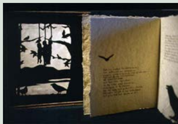
The Ballad of the Hangmen , 1998 Cut paper, edition of 5 François Villon (1431 - after 1463) Based on "the Ballad of the Hangmen" an epitaph Villon wrote himself. 10 x 11 x 2 1/2 inches