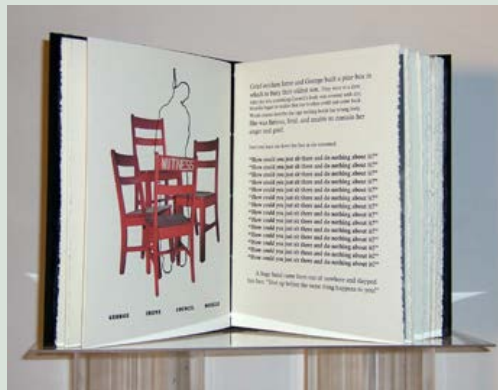
Clarissa Sligh It Wasn't Little Rock, 2004 Bookcloth on bookboard, digital pigment ink on paper, bound book in box with gloves Edition of 5 19 x 13 1/2 inches page size Courtesy of the artist (right)