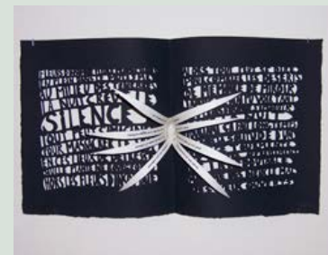
Fleur d'Insomnie , 2006 Cut paper, edition of 3 Frankétienne (born 1936-) lives in Haiti Flowers of Insomnia first published in Haiti 1986; revised edition 2005. 22 x 12 inches