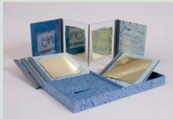
Amanuensis, 2008 Installation Pulp painting on hand made and cut paper sheets and Artists book with palladium gilded glass Dimensions variable Courtesy of the artist