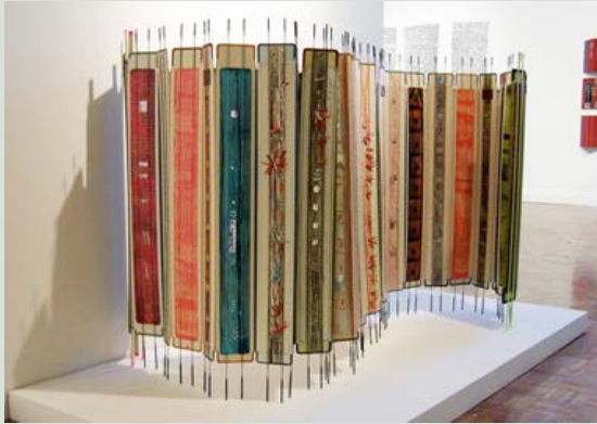
Zip-Off Fence, 2005 Mixed media on paper, metal, cord, plastic welding rods, fiberglass rods, twist, ties, zippers 48 x 48 x 48 inches Unique book piece