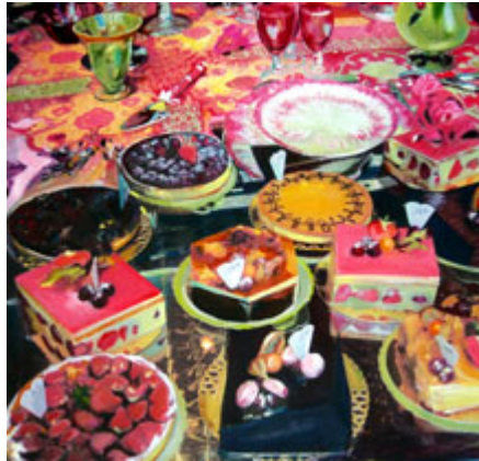
Sara Sill, Abundance I detail, 2006