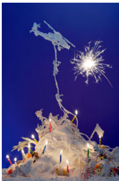
Pamela Hadfield, Great Escape , 2006