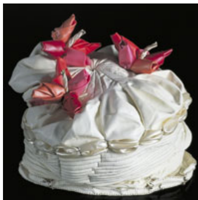
Julie Allen, Trio , 2003

The Wedding Cake , 2002 balloons and thread 10 x 13 x 10 inches