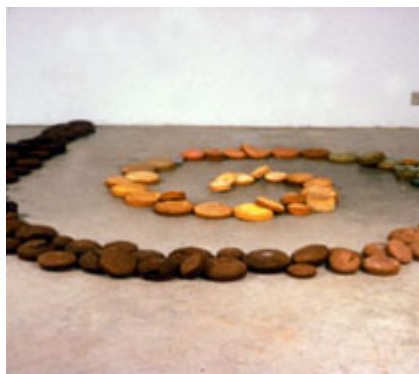
Becca Albee, Untitled (spiral cakes) , 1998

Untitled (hula hoop), 1998 plastic hula hoop with vanilla icing 45 x 45 x 45 inches