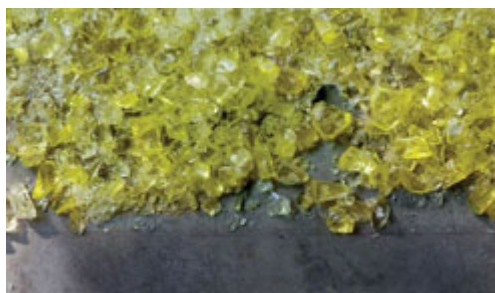
Rebecca Holland, Long Crush , 2007