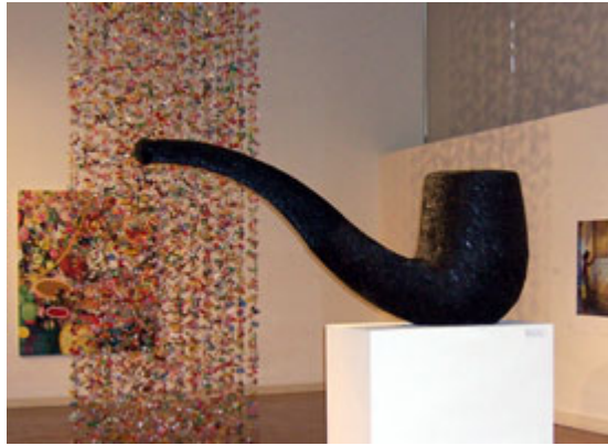
Andy Yoder, Pipe , 2007