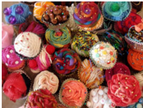
Vadis Turner, Cupcakes , 2006