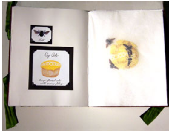
Dana K. Sherwood, Confektion "The Sweet Allure of Entrapment" , 2005