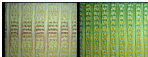
Gina Occhiogrosso, White into Yellow, Green into Yellow , 2003