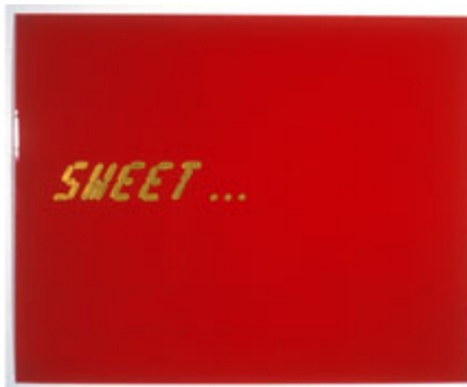
John Boone Taste Suite: Sweet , 2001