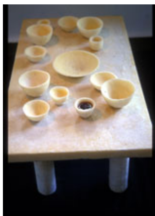
Yoshioko Kanai, Sugar Table/Communication , 2006