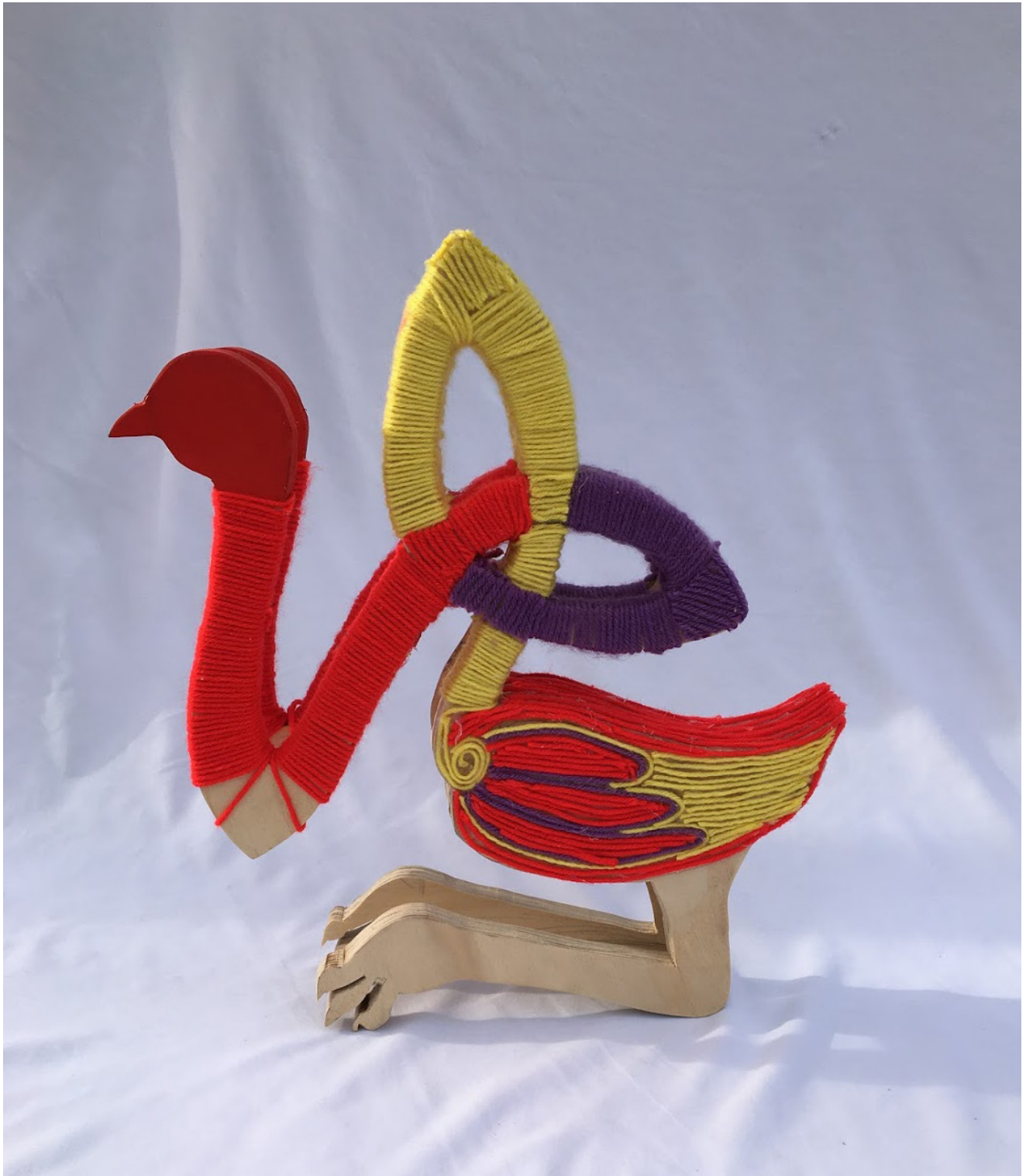
Celtic Pride Series 2020 Plywood, Yarn, Acrylic Paint, Silver Wire (Center Bird)