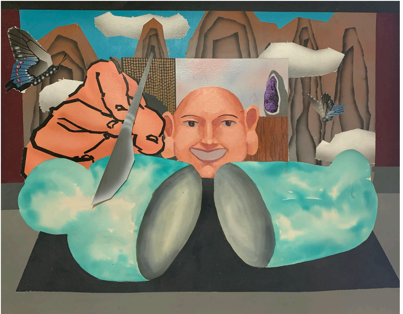
A Soul Surgery in the Facetime 2020 Acrylic on Paper