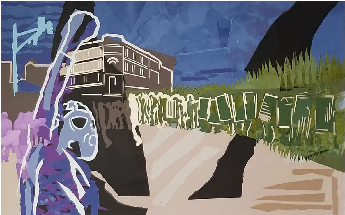
July II 2020 Colored & Dyed Paper Collage