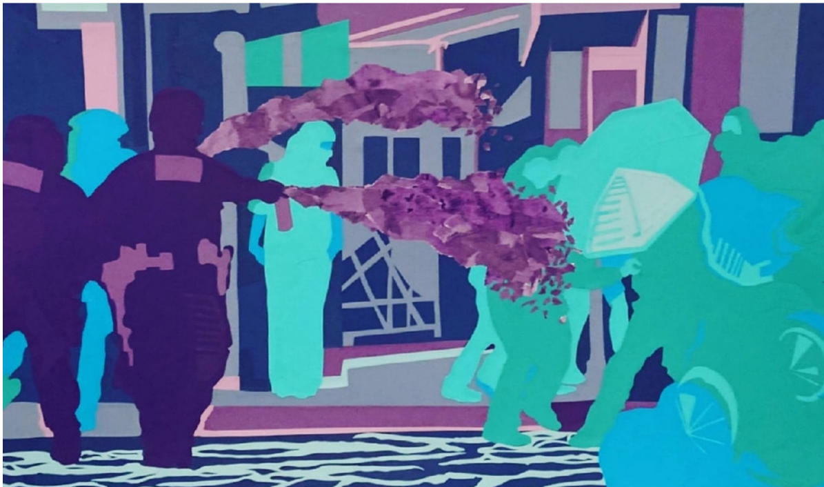
July 2020 Colored & Dyed Paper Collage