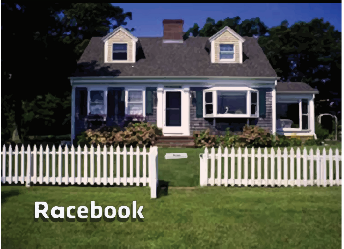
Race Book 2020 Digital Animation