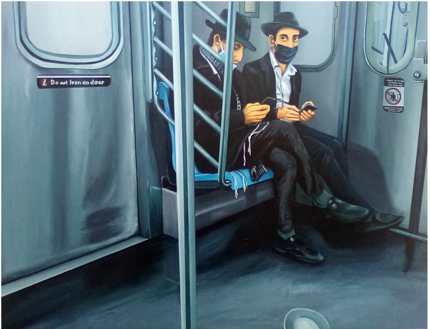
My Home Window 2021 Linen Canvas / Acrylic