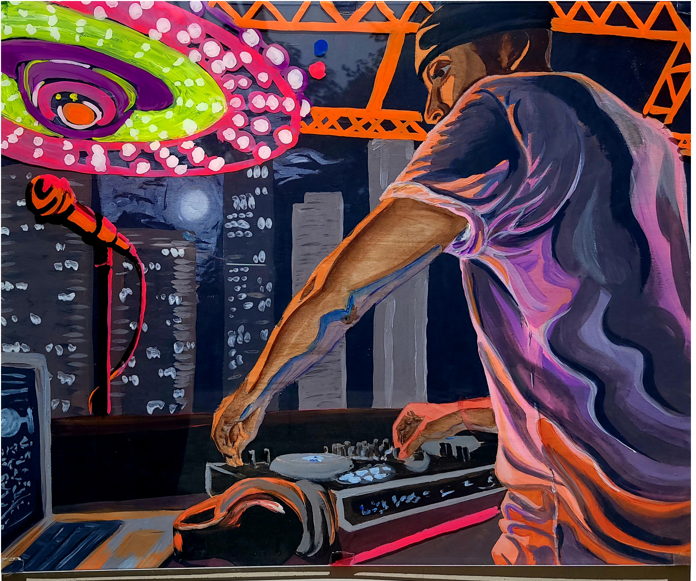
Behind the Plexi; Agela