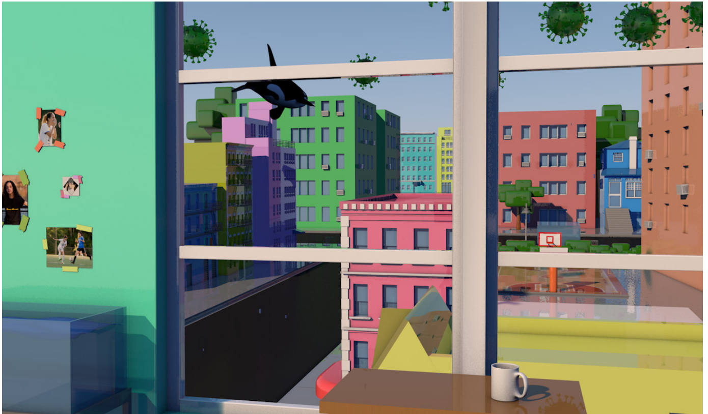
A Través De La Ventana (Through the Window) 2021 Digital Animation