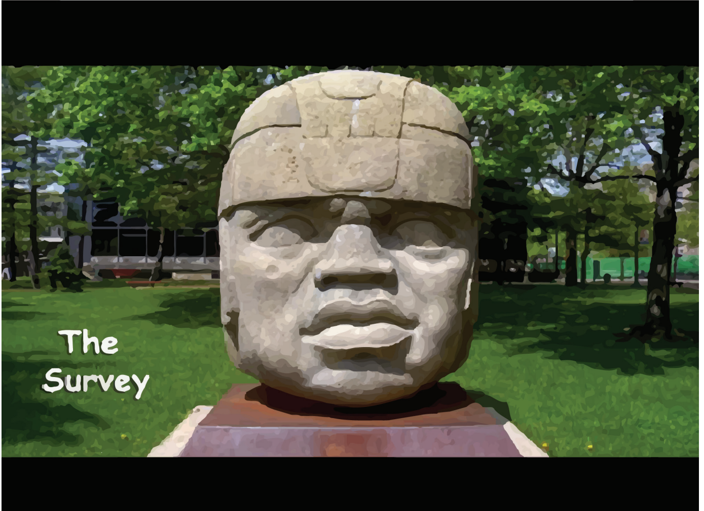
The Survey 2017 Digital video / Animation