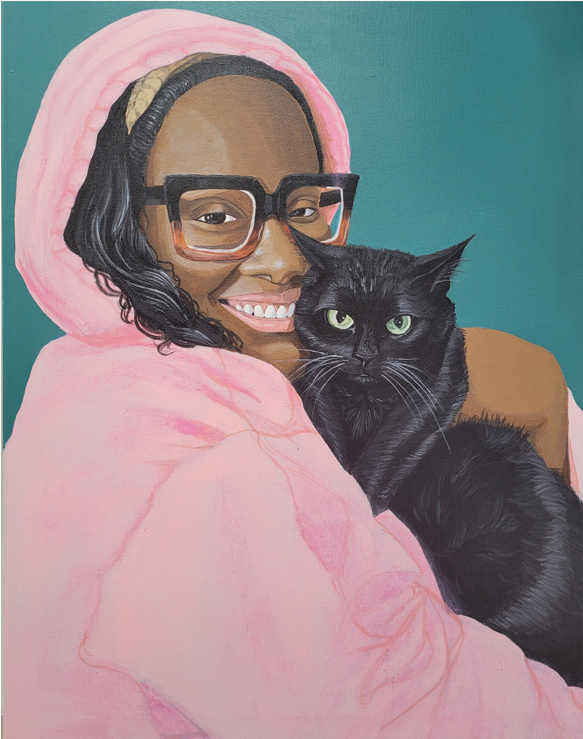
Serith and Shadow 2021 Acrylic and Oil Pastel on Canvas, 18" x 24"