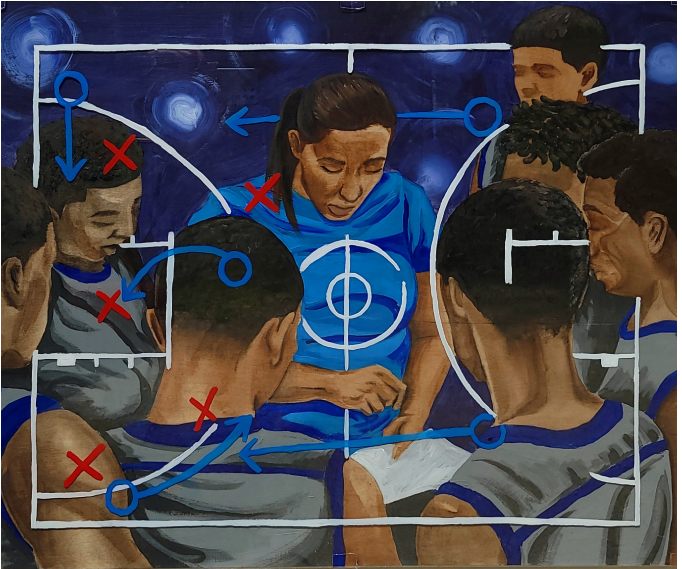
Behind the Plexi; Janina 2021 Wood, Plexiglass, Acrylic and Gouache, 24"x 30"