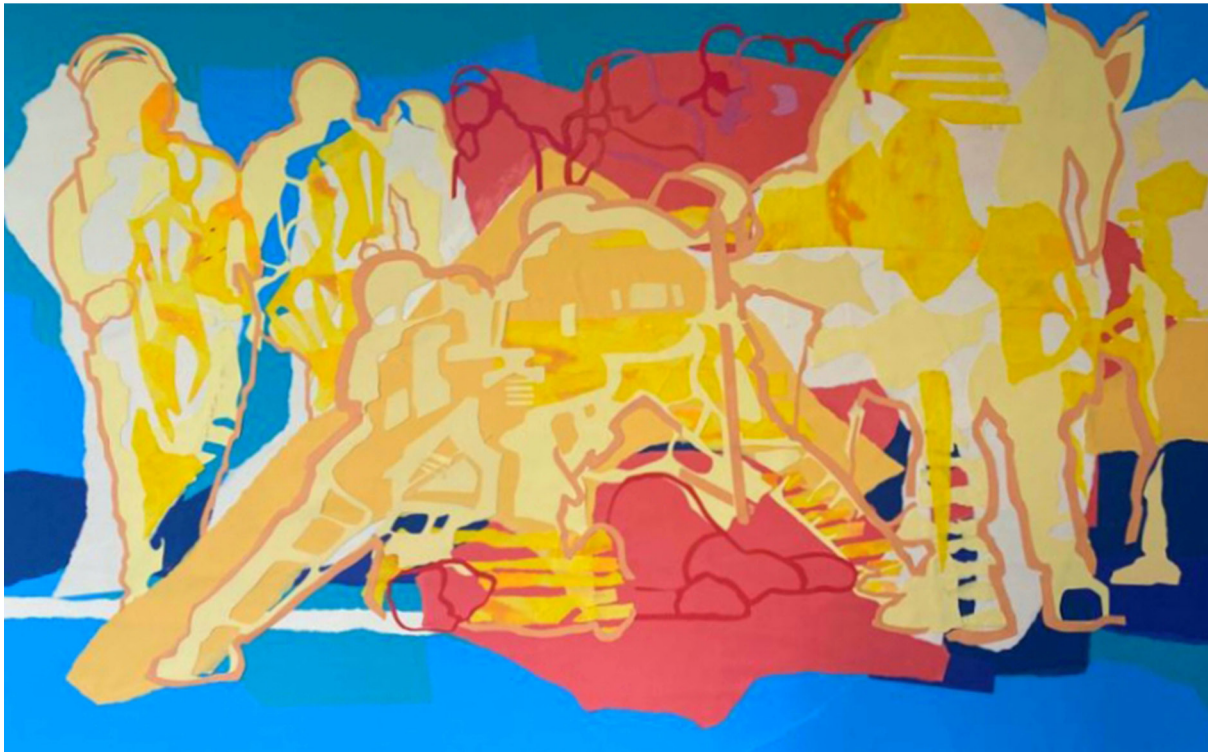
June 2020 Colored & Dyed Paper Collage