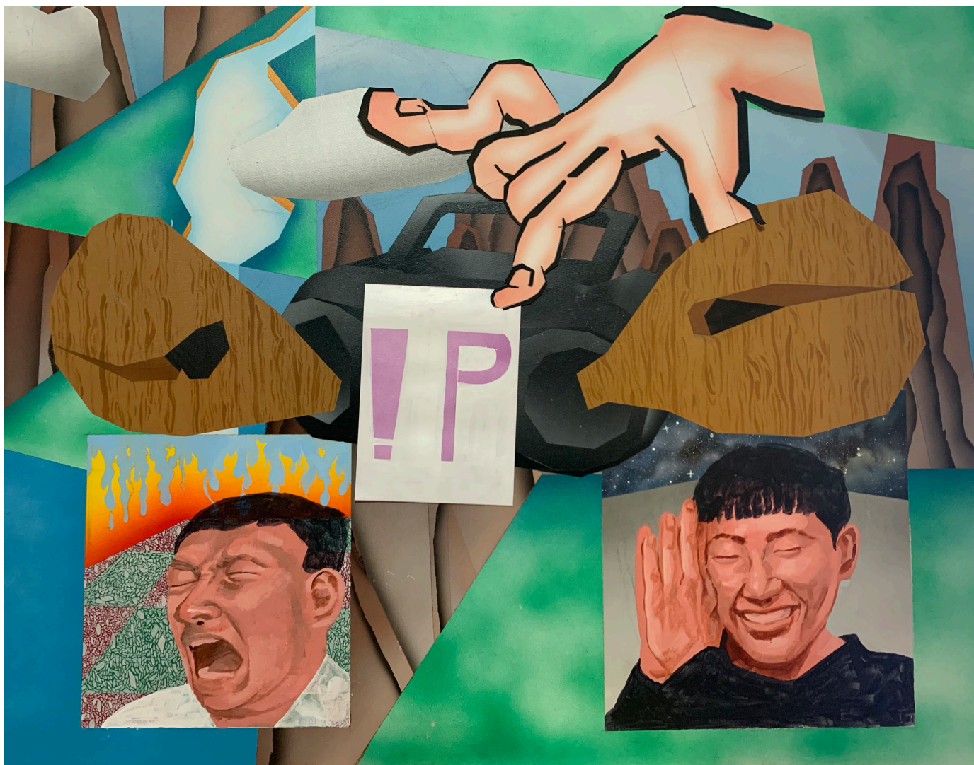
In the Chatting Room 2020 Acrylic and Paper Collage on Canvas