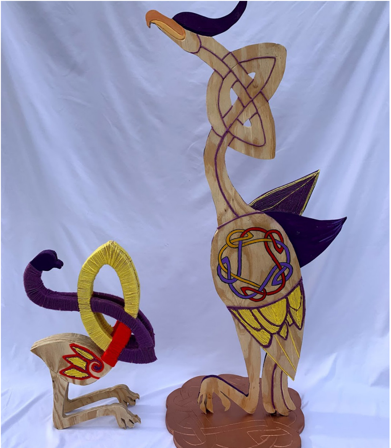
Celtic Pride Series 2020 Plywood, Yarn, Acrylic Paint