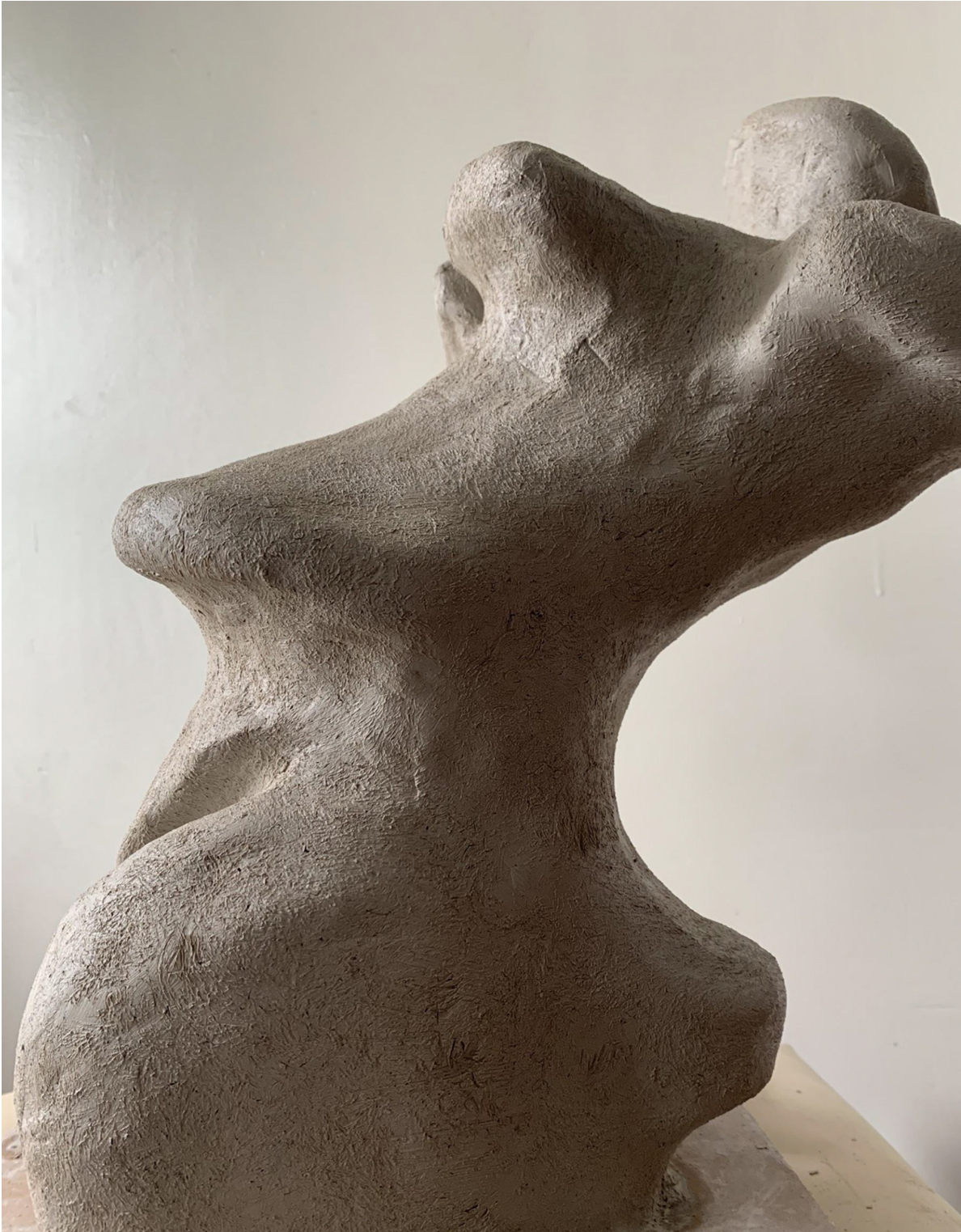
Aberrant Dance 2020 Clay