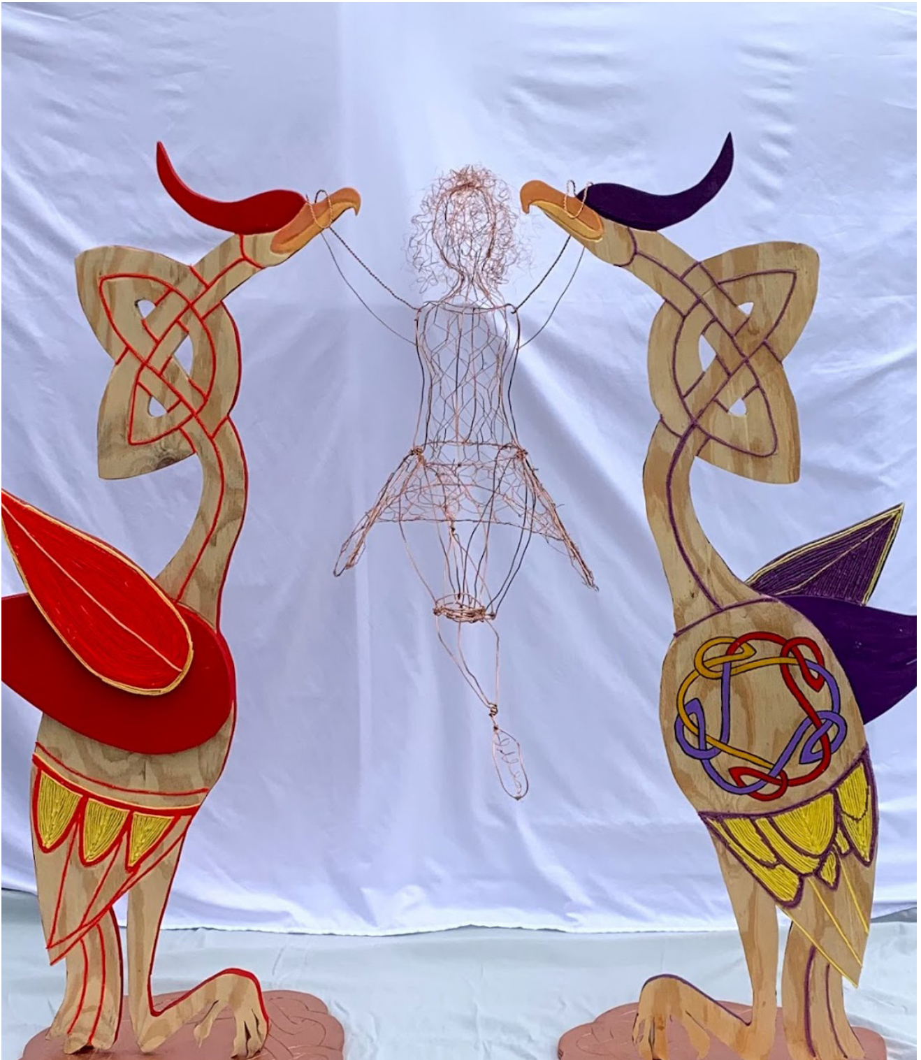
Celtic Pride Series (Series of Birds and an Irish Dancer) 2020 Plywood, Yarn, Acrylic Paint, Spray Paint