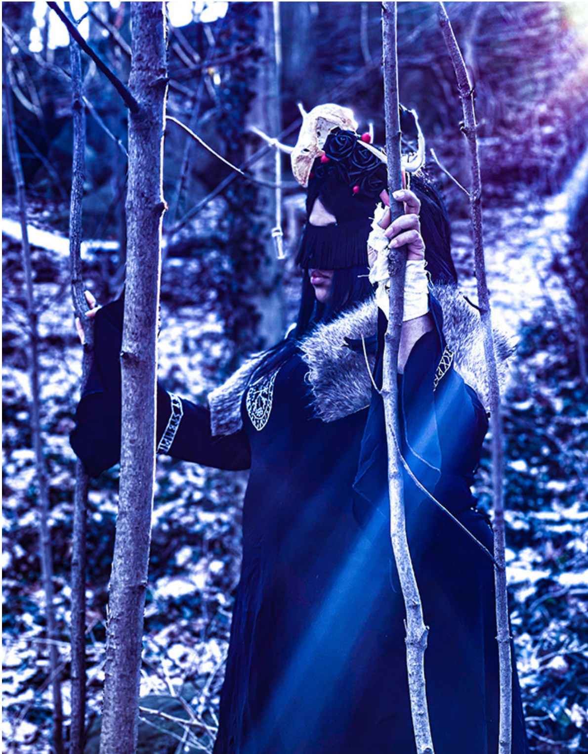
Dáinn in the Forest 2021 Digital Photography