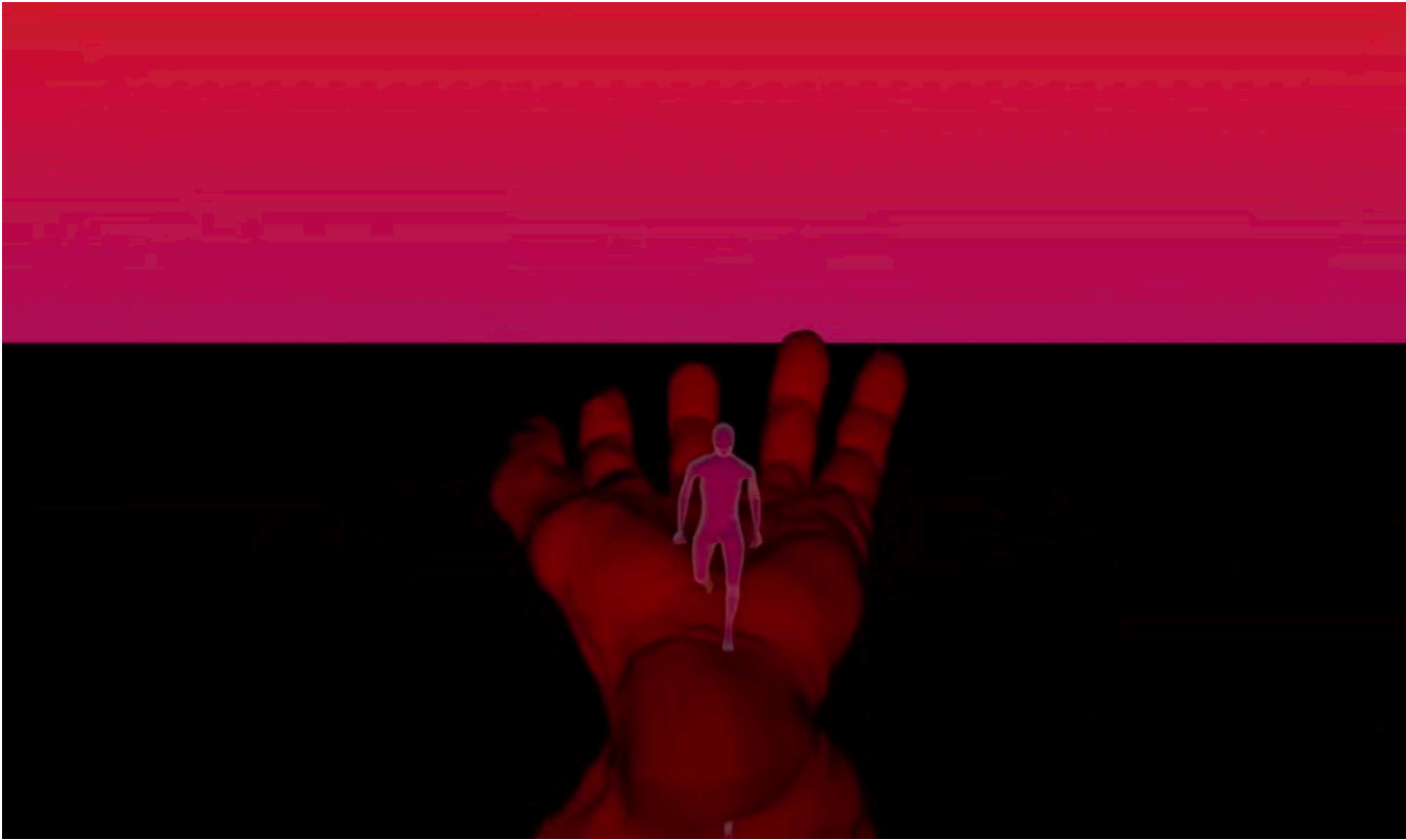
A Walk for Life 2021 Digital Animation