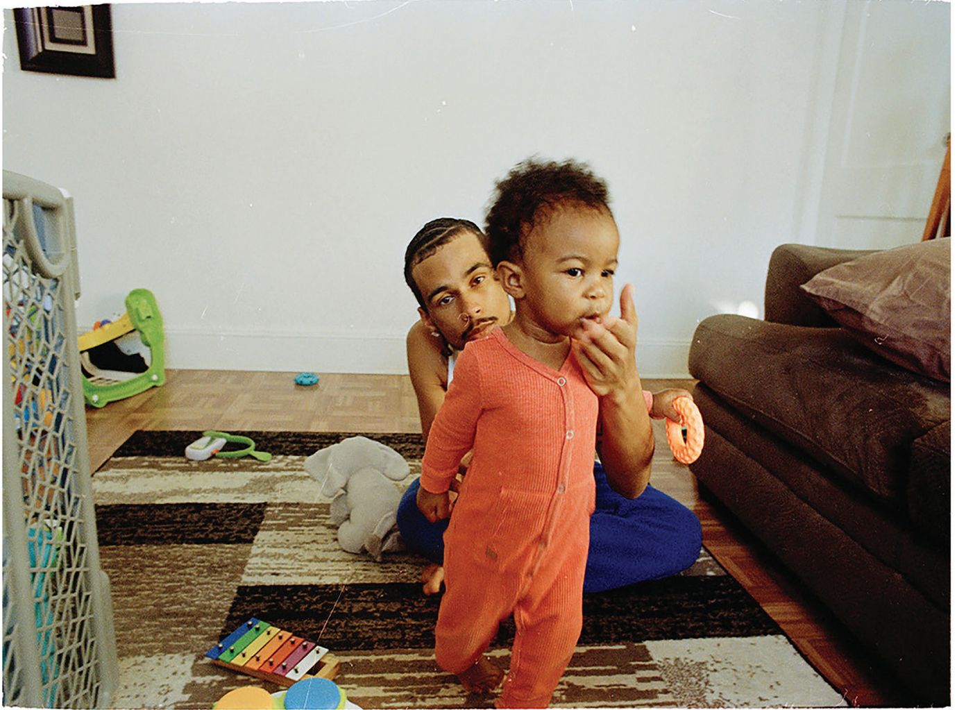
To Raise a Black Child 2020-2021 35mm Color Film