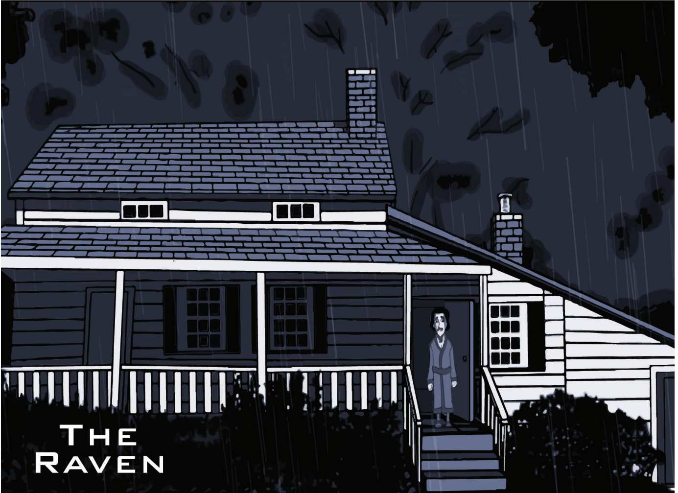
The Raven 2019 Digital Animation