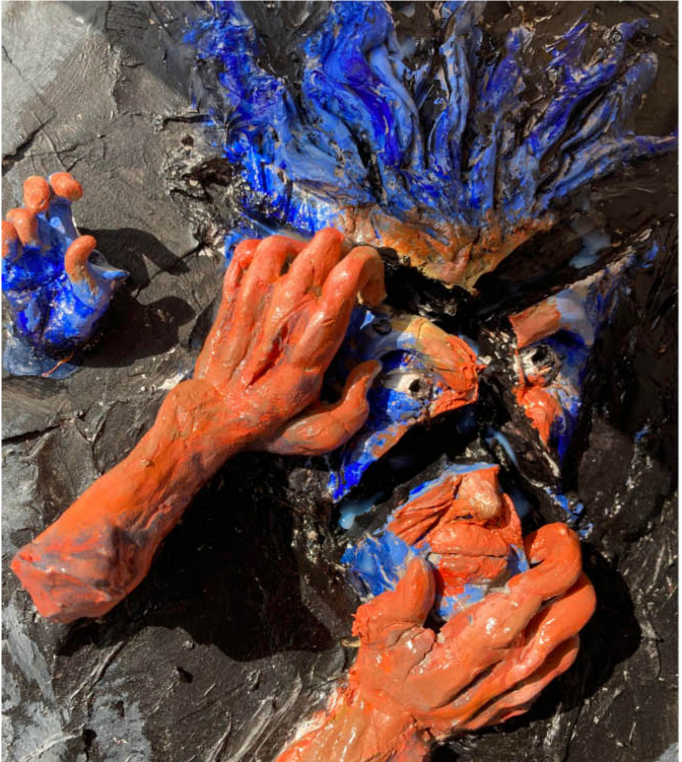
Neurogenesis 2021 Acrylic, Oil on Canvas and Plywood