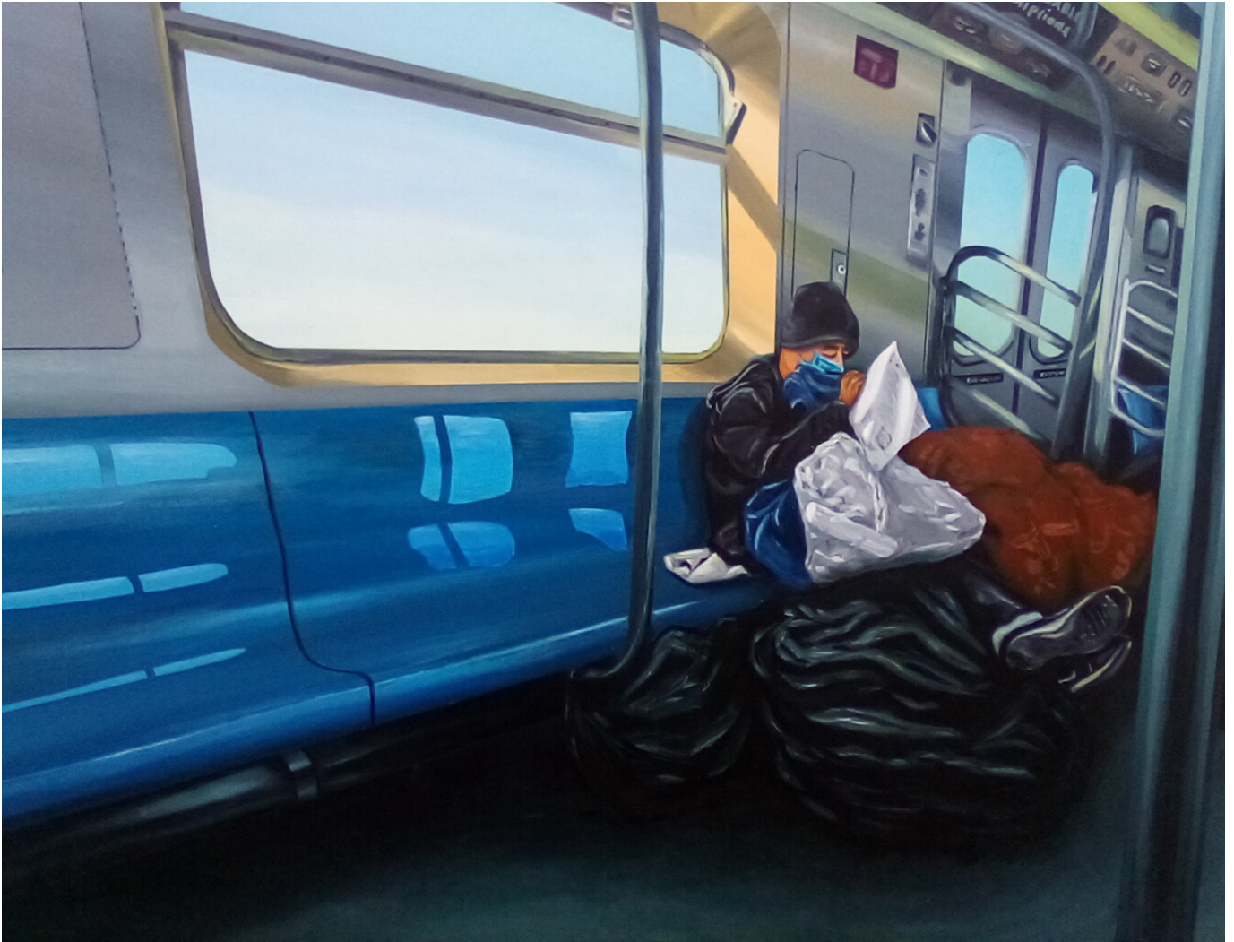
Faithful Ride 2021 Linen Canvas / Acrylic