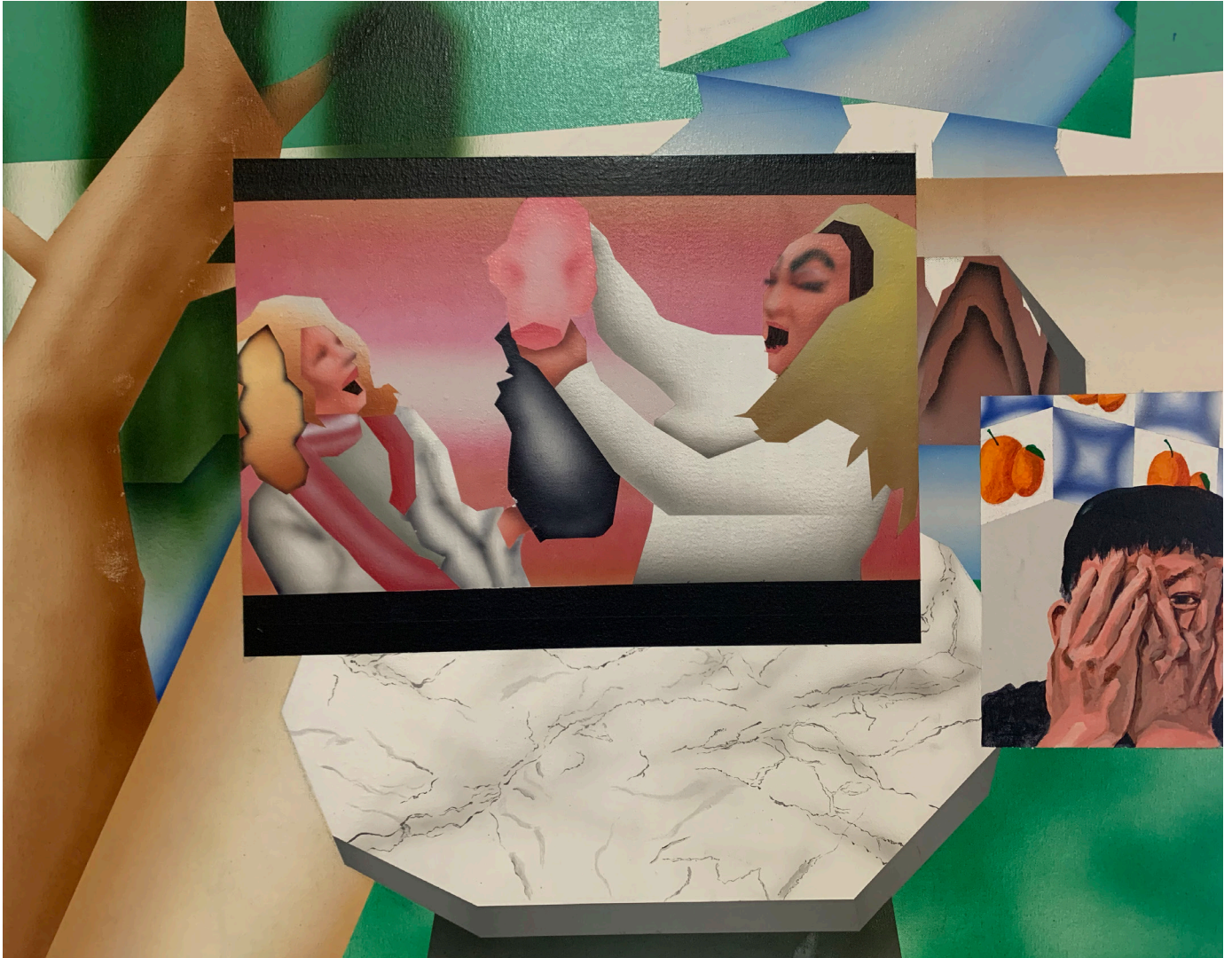
Movie Time in the Chatting Room 2020 Acrylic on Canvas