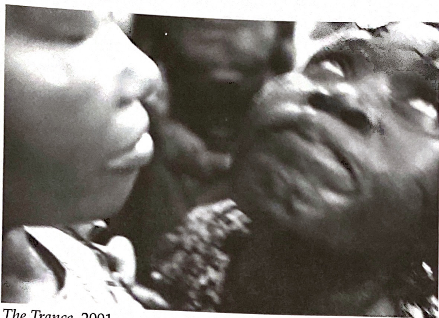
The Trance , 2001

Island Possessed—Vodou Rituals in Haiti is an intimate photographic exploration documenting the contemporary practice of Vodou in Haiti. Vodou, a syncretic religion incorporating West African traditions within Catholicism, is practiced by thousands of Haitians. Seymour approaches this project as an insider who has documented major celebrations and ritual sites in an attempt to dispel misconceptions and to create a better understanding of the practice of Vodou. This exhibition of work from the past four years is a part of Seymour's ongoing documentary series.