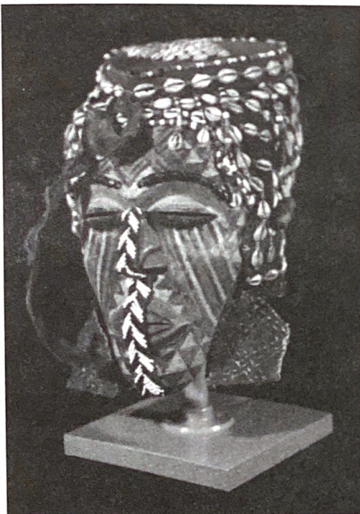
Ngaady amwaash , Kuba region of Congo, late 20th century

Display Case E: Kuba Women's beaded belts ( nkody-mu-ikup lakiing ) : The women's ceremonial belts included in this exhibition consist of a central section composed of beaded raffia cloth, and two long, rectangular side panels of woven raffia cloth embroidered with cowrie shells and beads. In the central section, many of the belts also have either one or two bead-covered knots.