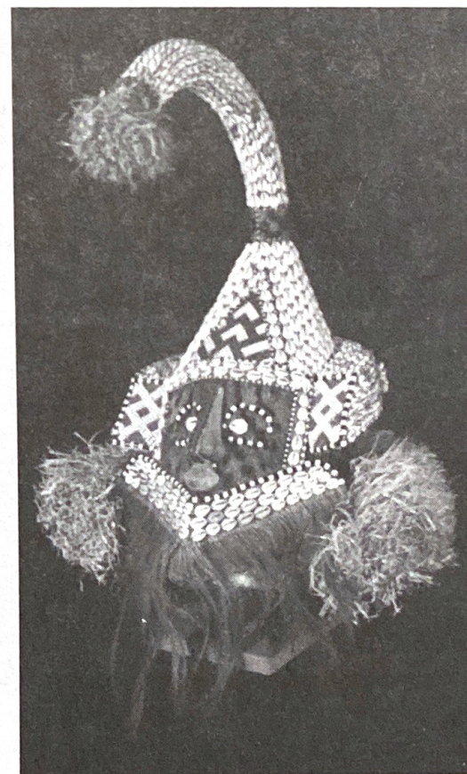
Mukyeem mask, Kuba region of Congo, late 20th century