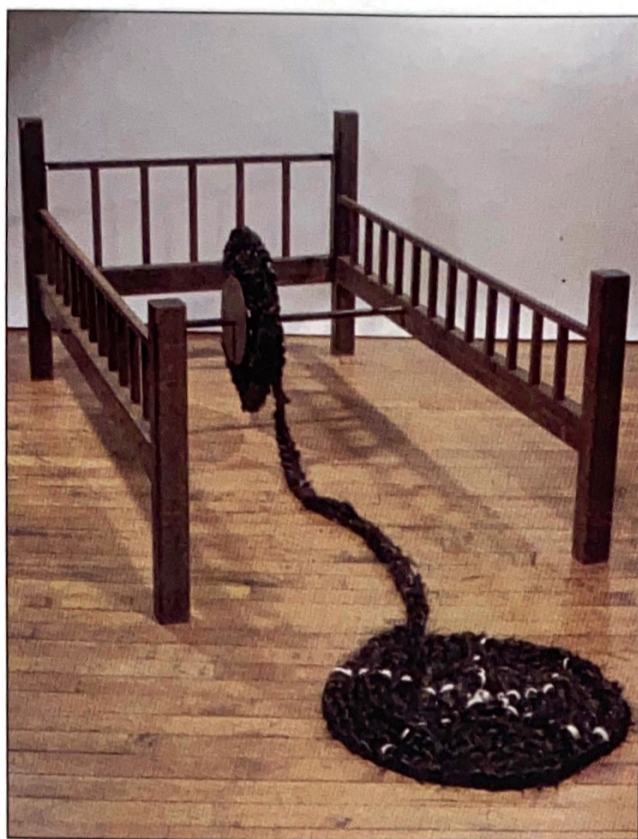
Ellen Driscoll Untitled , 1995 Steel bed, horsehair braid, stone