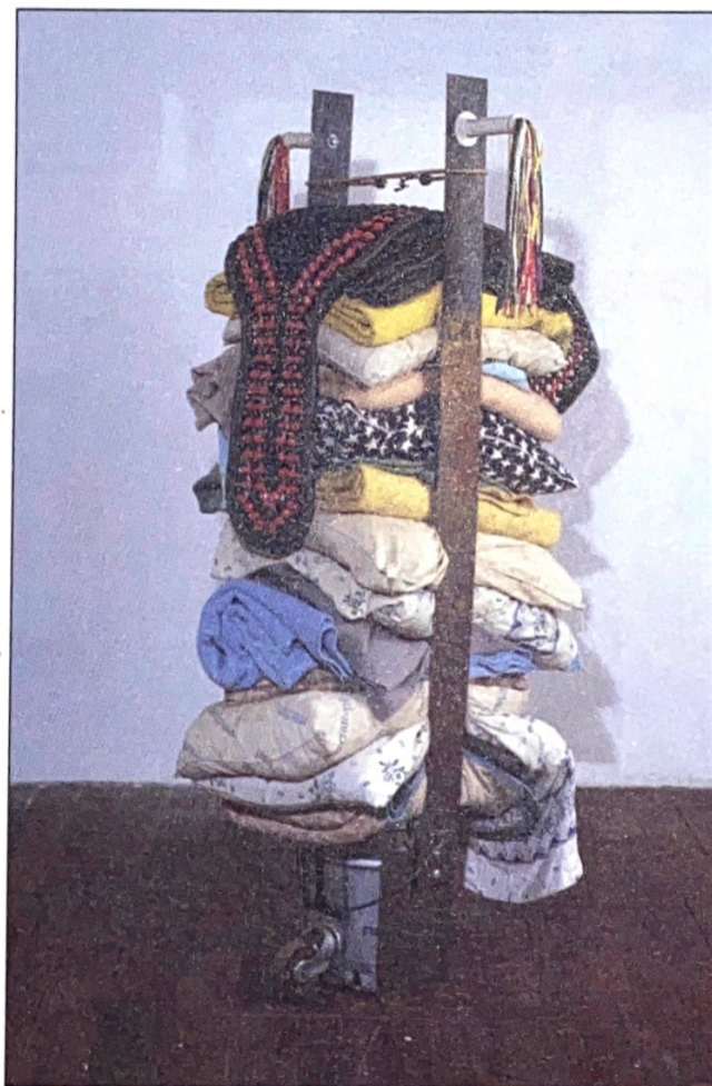
Michael Pribich Untitled , 1992-4 Mixed media with wheel

The Lehman College Art Gallery presents 20th-century art in the Edith Altschul Lehman Gallery and the Robert Lehman Gallery, two striking exhibition spaces on the first floor of the Fine Arts Building, designed by Marcel Breuer. The Gallery also conducts art education programs in collaboration with Bronx public schools, and is a pioneer in the use of interactive media for the visual arts with projects ranging from the production of a CD rom on Bronx public art to on-line exhibition catalogs to performance art. The Art Gallery's acclaimed on-line journal Talkback! A Forum for Critical Discourse was described by The New York Times as the "electronic ticket for pondering the deeper meaning of the Internet." Art critic Robert Atkins is editor of the quarterly journal; art student Florian Penev designs its home pages.