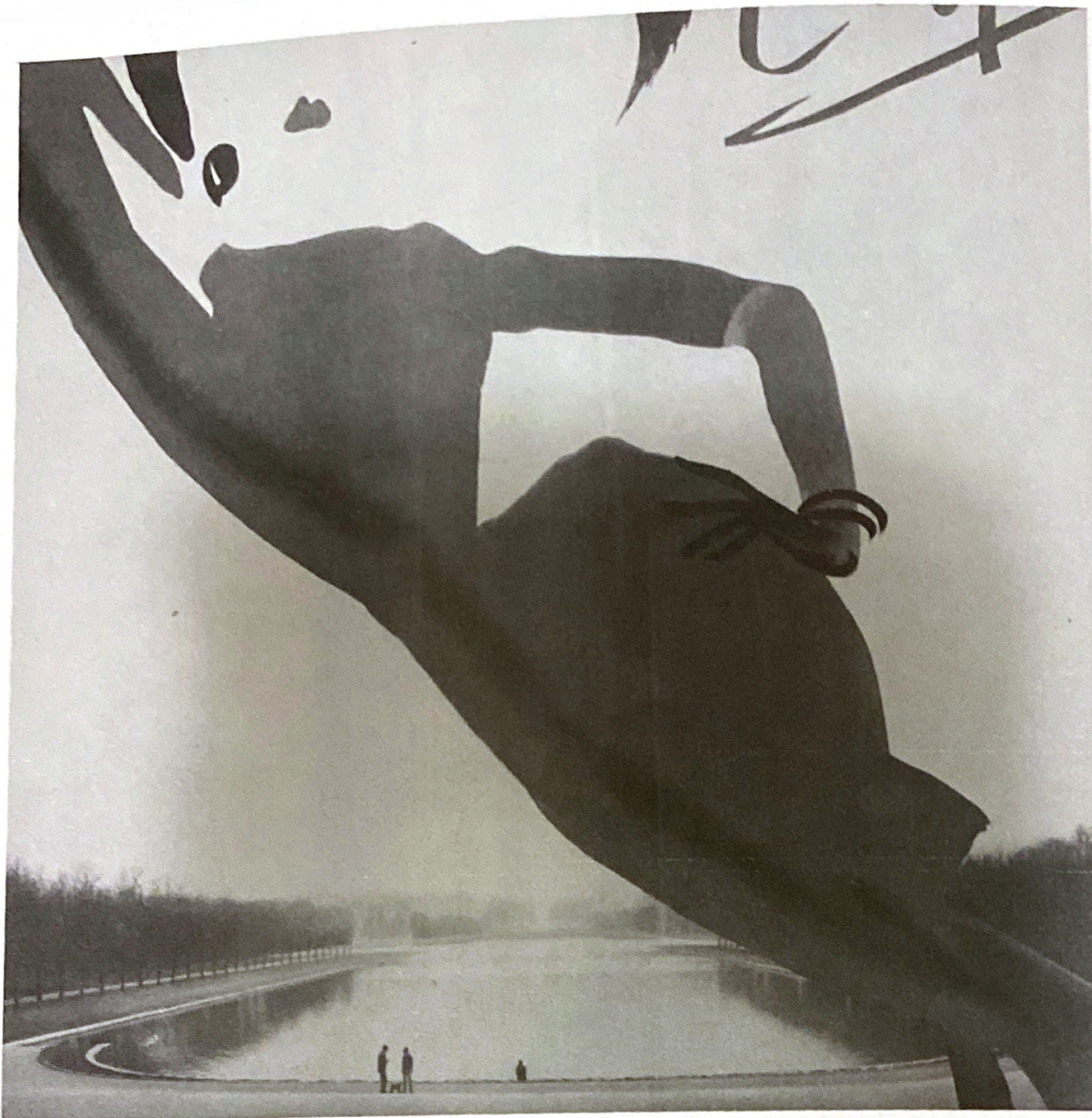
Eric Bulatov La France , 1993 Oil on canvas, 79 x 79"