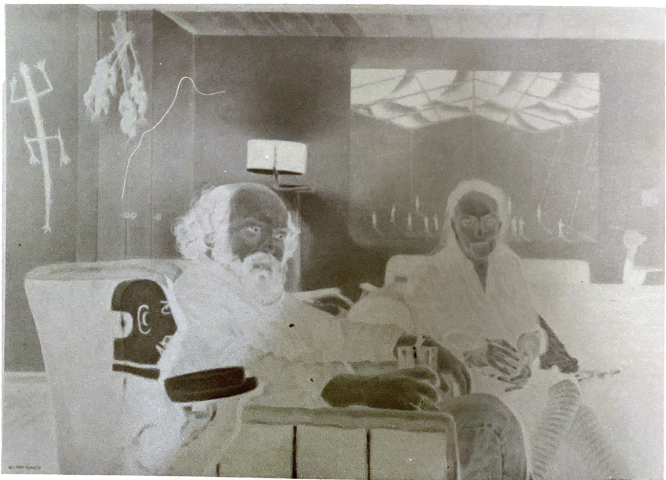
Simon Faibisovich The Little Funny People, 1990 Oil on canvas, 59 x 79"