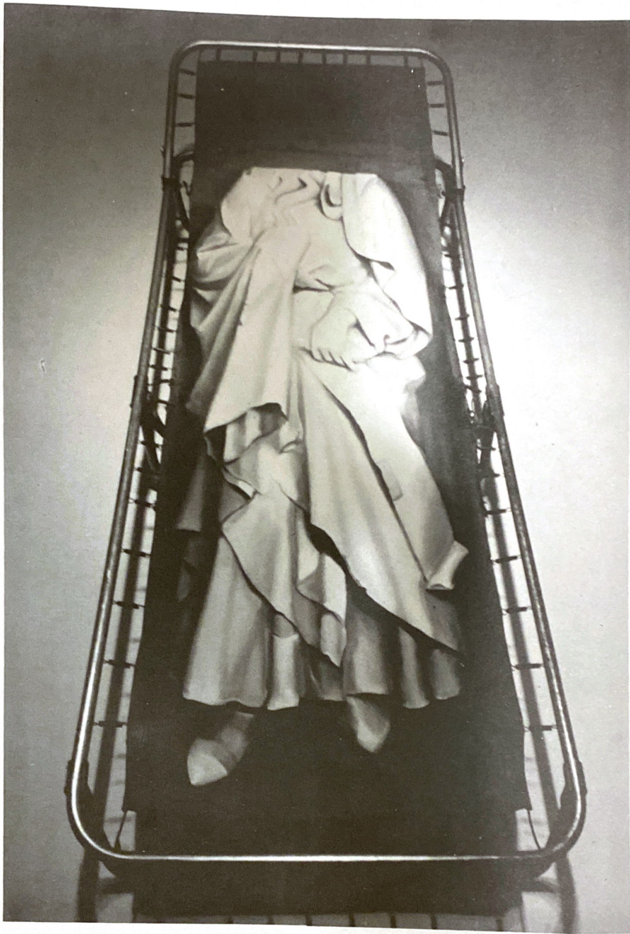
Irina Nakhova Camping , 1990 Oil on canvas, acrylic on cotton, 78 x 28 1/2"