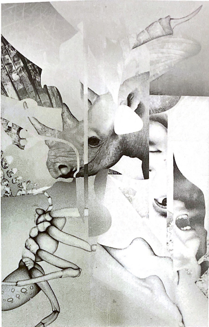
Sergei Batovrin Untitled, 1992 Oil on canvas, 80 x 50"