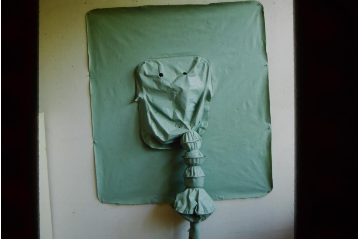
Pike Powers Nymphettes , 1990 Vinyl 60 x 84"