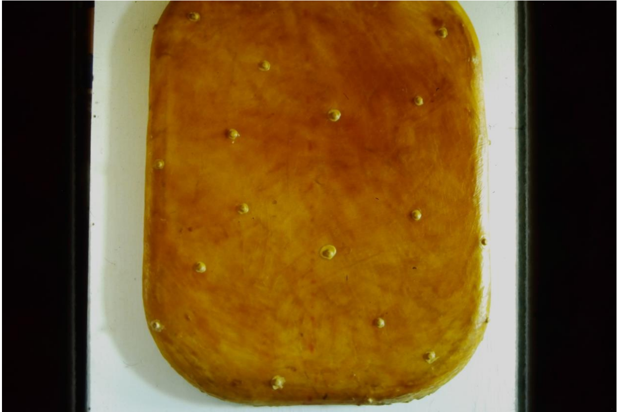
Pike Powers Untitled , 1990 Vinyl 42 x 36 inches