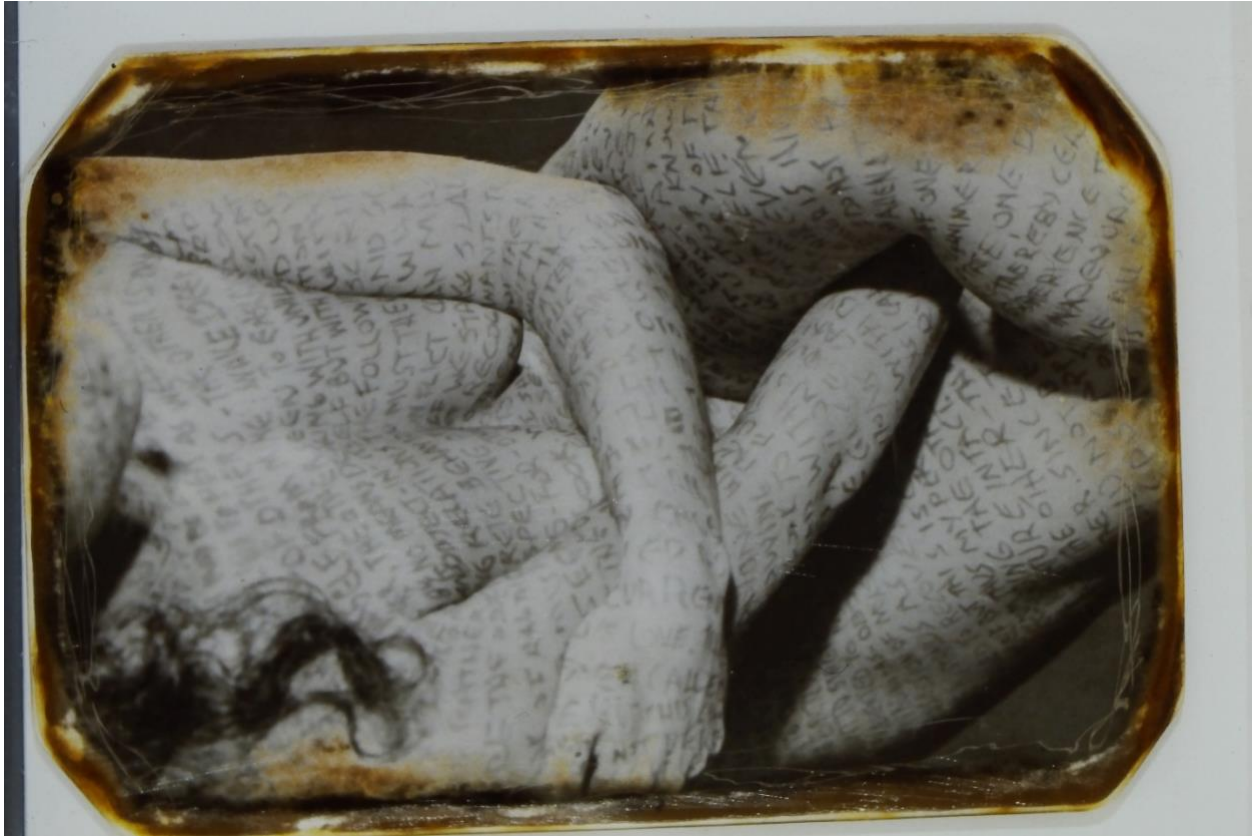
John Roche Cross , 1990 Silver gelatin photograph on board 5 3/4 x 3 7/8 inches (unframed) Edition: 2