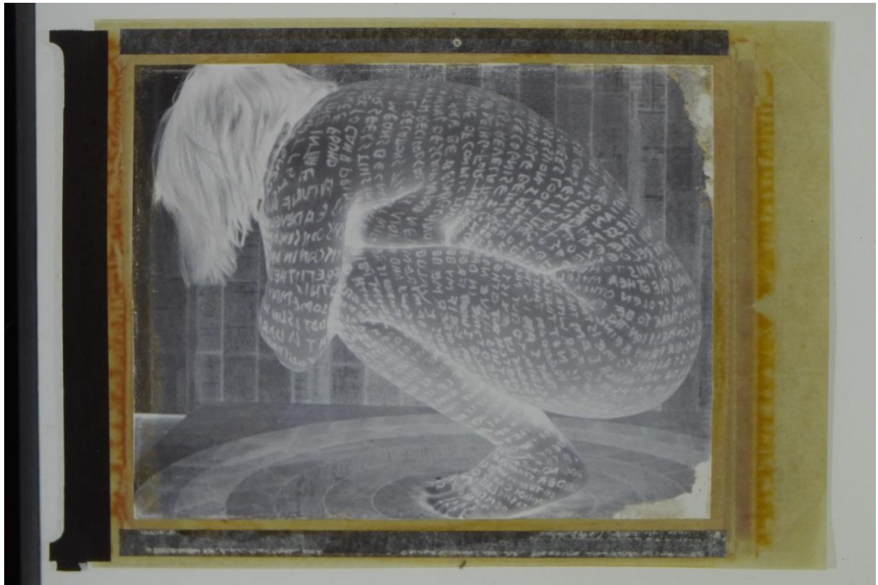
John Roche Still Life (Polaroid) , 1992 Type 55 Polaroid 4 ¼ x 6 1/8 inches Edition 9