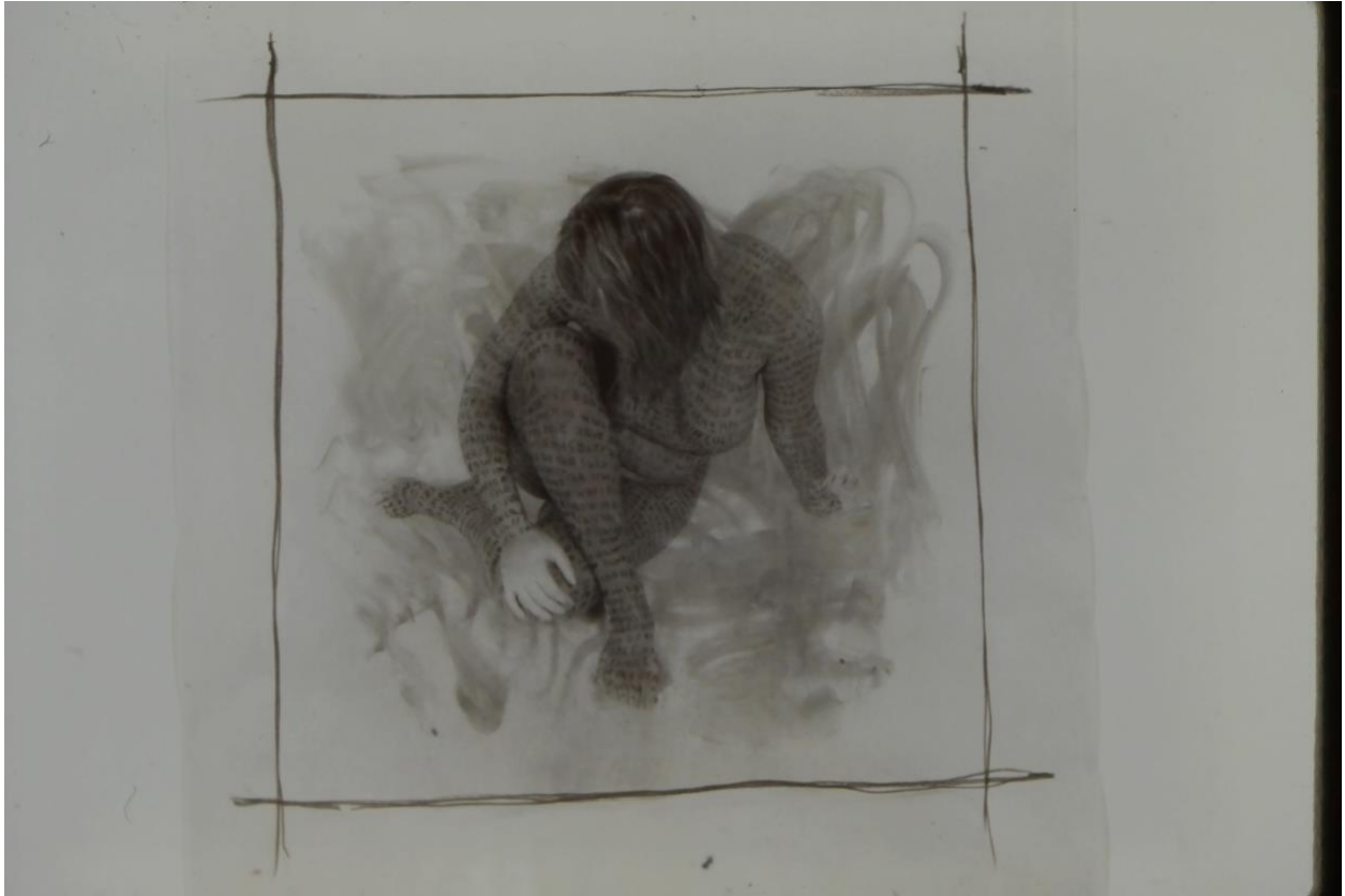
John Roche Untitled , 1992 Graphite and varnish 38 3 / 4 x 35 3 / 4 inches