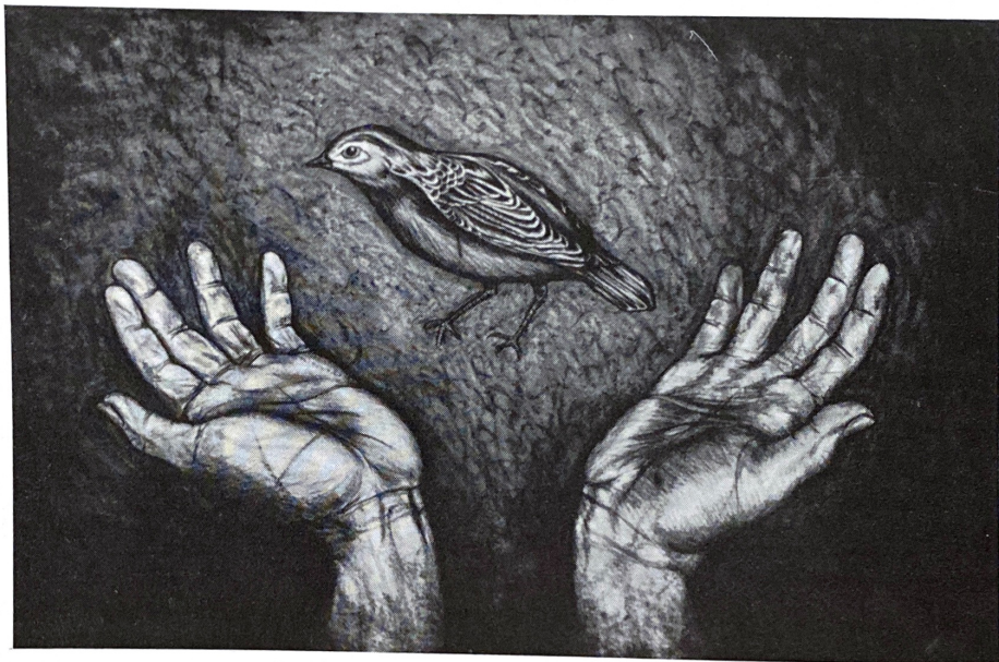
Whitfield Lovell, Bird , 1988, oil stick and charcoal on paper, 25 x 38"