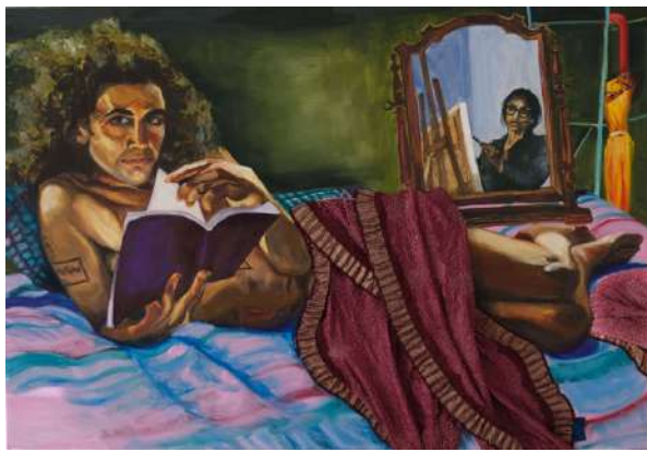
Bhasha Chakrabarti إقرب, إقرأ ( Beshouy as Olympia ), 2023 Oil on linen, used clothing 51 x 75 inches x 1¼ inches