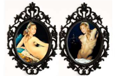
Arlene Rush Twins Cameo IV (Diptych) , 2012 Digital prints with frames 33 1/2 x 48 x 2 inches