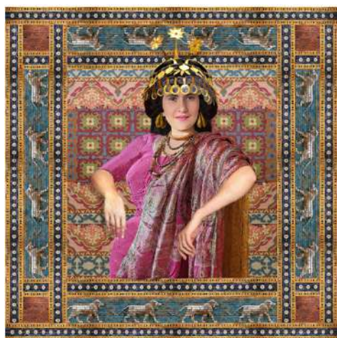
Camille Eskell Queens of Babylon: Take Back What's Yours, 2022 Digital collage on archival paper 24 x 24 inches