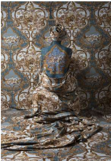
Cecilia Paredes Hermitage , 2017 Performance registered in photography 33 x 52 inches