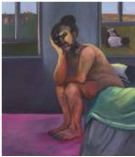
Cheyenne Julien Can't go out, Can't stay in , 2019 Oil on canvas, 60 x 52 inches Private Collection, Atlanta, GA