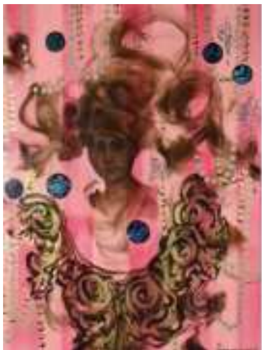
Scherezade García Tigon II , 2017 Acrylic, charcoal and ink on linen 66 x 50 inches