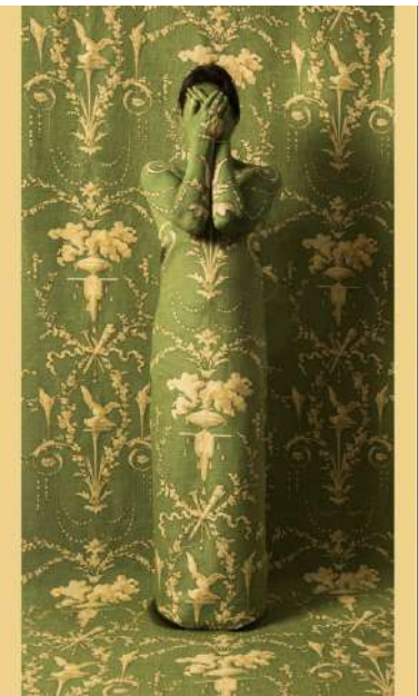
Cecilia Paredes The Secret , 2018 Performance registered in photography 33 x 55 inches