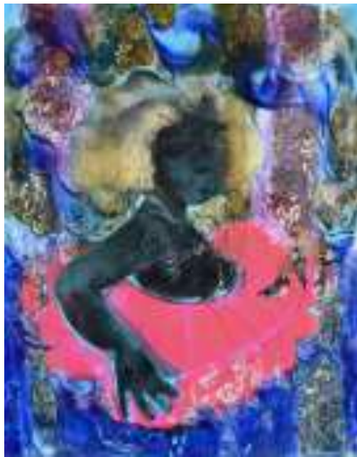
Scherezade García Aroma of Cacao , 2022 Acrylic pigment, charcoal and ink on canvas 63 x 51 inches