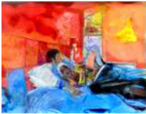
Lewinale Havette Constellation , 2023 Mixed media 36 x 48 inches