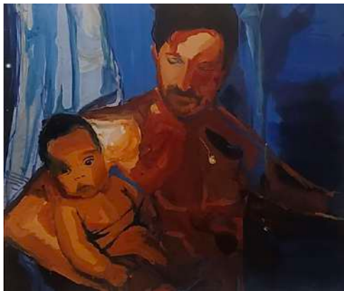
Lewinale Havette Man With Child , 2023 Mixed media 24 x 20 inches