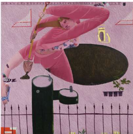
Celeste Rapone Muscle for Hire , 2022 Oil on canvas 67 1/8 x 67 inches Courtesy of the artist and Marianne Boesky Gallery, NY and Aspen