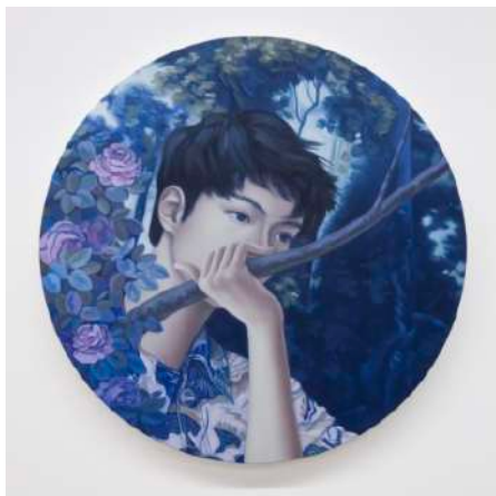
Jesse Mockrin The Hunter , 2017 Oil on linen 28 × 28 inches © Jesse Mockrin Private Collection, NY