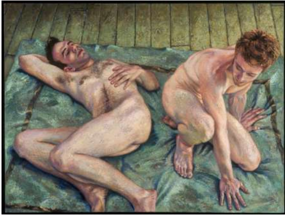
Phyllis Gay Palmer Crouch , 1997 Oil and wax on canvas 36 x 48 inches Courtesy of the artist