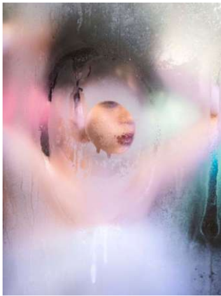
Marilyn Minter Target , 2017 C-print, 86 x 64 ½ inches Edition 3 of 3, 2 A.P. (MnM 994.3)