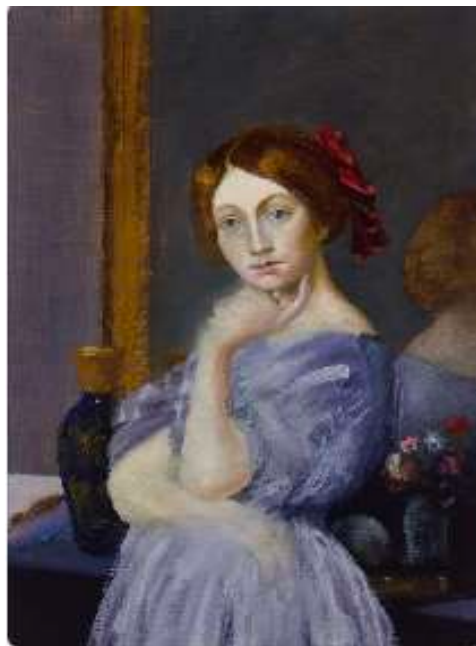
Elise Ansel The Red Ribbon (after Ingres) , 2015 Oil on linen., 30 x 22 inches