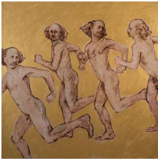
Sharon Wybrants Art Guerra Running , 1979 Oil on canvas 48 x 48 inches Private Collection