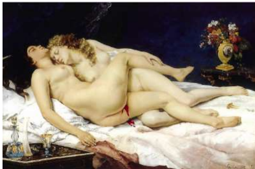
Lizzy Alejandro Herstory , 2023 Site-specific Lehman Rotunda Installation