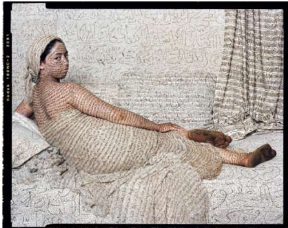
Lalla Essaydi Les Femmes du Maroc: La Grande Odalisque , 2008 Chromogenic print 33 x 40 inches, Edition of 15