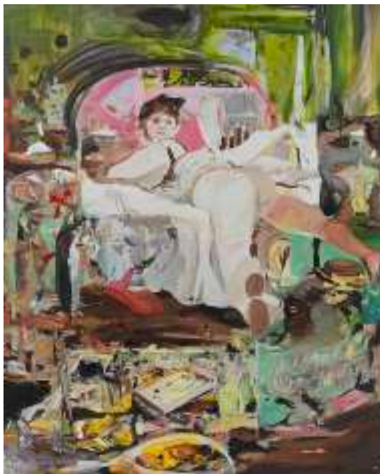
Cecily Brown Nana, 2023

Oil on canvas, 40 x 48 inches