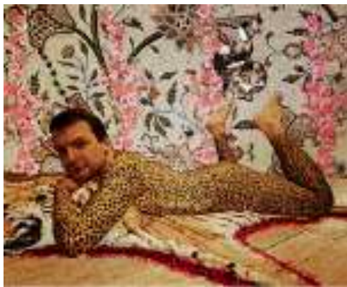
Katie Commodore Greg in His Catsuit , 2018 Digitally woven cotton thread applique, plastic beads, and embroidery 50 ¾ x 57 ½