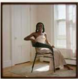
Christie Neptune Guild of Light 2020 Archival inkjet print 30 x 30 inches