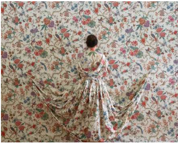
Cecilia Paredes The Dream , 2022 Performance registered in photography 39 x 39 inches