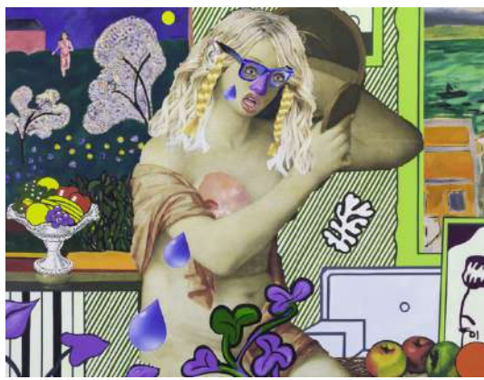
Allison Zuckerman Woman at her Toilette , 2017 Acrylic and inkjet on canvas, 125 ¼ x 162 inches Collection of the Rubell Museum