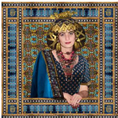
Camille Eskell Queens of Babylon: Re-find Your Power, 2022 Digital collage on archival paper 24 x 24 inches