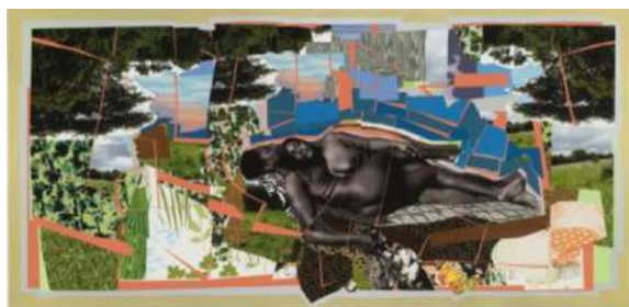
Mickalene Thomas Sleep: Deux Femmes Noires , 2013 Woodblock on paper, silkscreen on paper, and photographic elements 32 1/8 x 74 7/8 inches