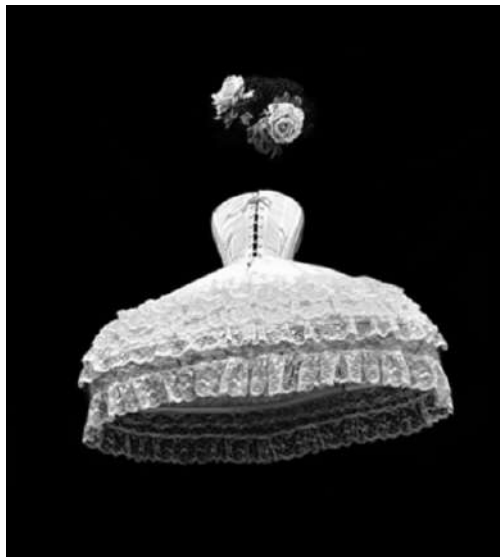
Ayana V. Jackson The Vase that Holds the Flowers in her Hair , 2021 Archival pigment print on museum etching paper. Edition of 8, plus 3 artist's proofs (#2/8) 39 3 / 8 x 35 5 / 8 inches Collection of Tiffanye Threadcraft