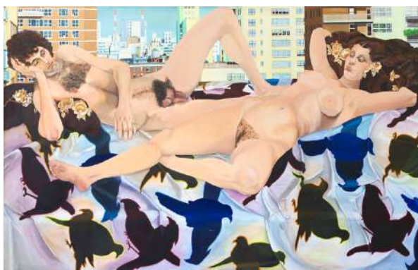
Martha Edelheit Birds: A View from Lincoln Tower Terrace , 1974 Acrylic on canvas 54 ½ x 87 inches © 2023 Martha Edelheit / Artists Rights Society (ARS), New York Courtesy of Eric Firestone Gallery, NY