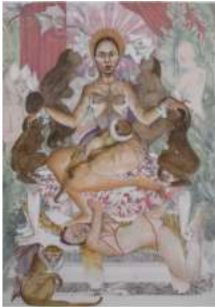
Fay Ku Throne , 2016 Graphite, acrylic and oil paint on two layered sheets of drafting film 42 x 30 inches