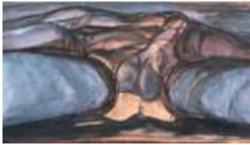
Eunice Golden Landscape #160 , 1972 Mixed media on paper, 26 x 51 inches Courtesy of Guild Hall, East Hampton, NY