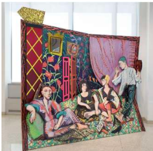
Mimi Gross Dark Air: After Delacroix's Women of Algiers , 1980-81 Oil paint on wood, Plexiglas, mirrored Plexiglas, vinyl, linoleum, aluminum, and Gator Board 109 x 117 x 33 inches © 2023 Mimi Gross / Artists Rights Society (ARS), New York.