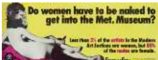
Guerrilla Girls Do Women Have to Be Naked to Get Into The Met Museum? 1989 Vinyl enlargement, © Guerrilla Girls Courtesy Guerillagirls.com