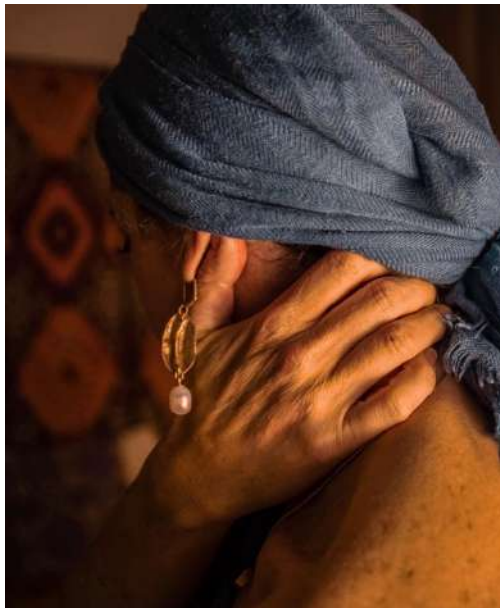
Lara Alcantara Lansberg Holding on Tight , 2022 Photograph 21.5 x 18.5 inches