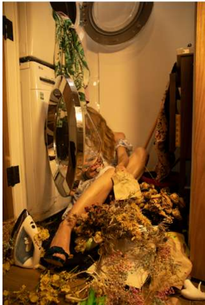
Lara Alcantara Lansberg Untamed , 2023 Photograph, 55 x 33 inches

October 12 – December 12, 2023 Reception October 12, 12 noon - 2 pm