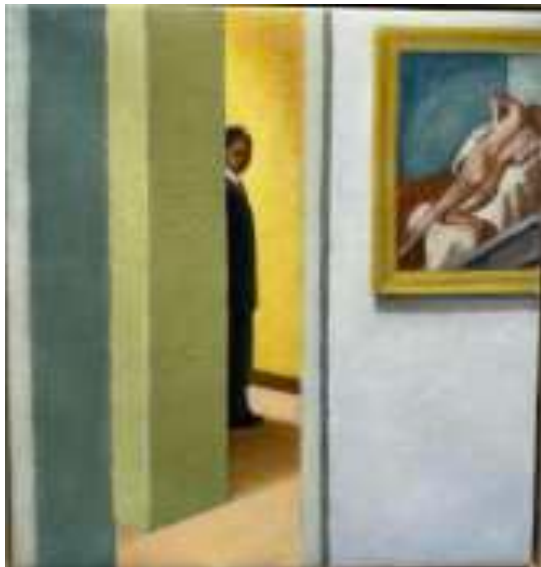
Judith Wyr Barely There , 2020 Oil on linen 18 x 17 inches