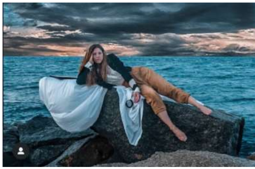
Lara Alcantara Lansberg Prisoner of my own Freedom , 2021 Photograph, 42 x 63 inches