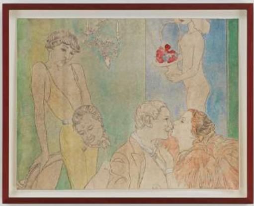
Hilary Harkness Girl with a Basket of Flowers , 2011 Watercolor and colored pencil on paper 10 x 13 inches