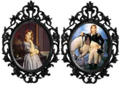
Arlene Rush Twins Cameo III (Diptych) , 2012 Digital prints with frames 33 ½ x 48 x 2