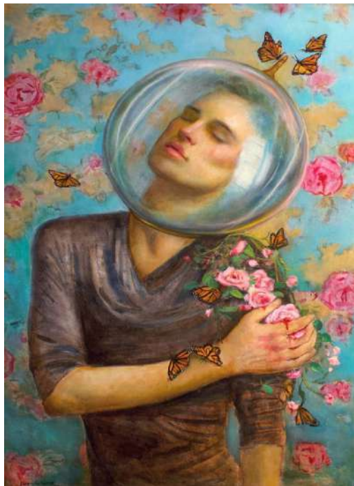
Rose Freymuth-Frazier Love Seeker , 2022 Oil on linen, 24 x 36 inches